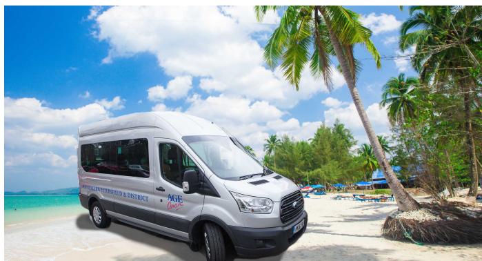
Elsa enjoys a well-earned rest on a tropical beach!

We always need new drivers. We can't promise a trip to sunny Fiji but we can offer a very warm welcome. Help us continue to provide these vital services which are sometimes the only highlight in someone's life. Call Sheridan to find out more.